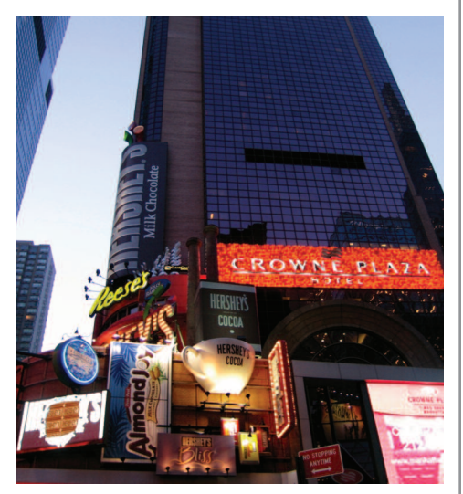
The Crowne Plaza Times Square received a cash rebate of $13,200 from the Con Edison Commercial & Industrial Program for replacing 3,300 40-watt incandescent light bulbs. The new lights will have a longer life span and will save the hotel more than $140,000 annually.

Con Edison's Commercial and Industrial (C&I) Energy Efficiency Program can help to reduce energy consumption in office buildings. This program provides C&I customers cash rebates and incentives for implementing energy efficient solutions and installing energy efficient equipment upgrades. Available for both gas and electric projects, these energy efficiency upgrades can help improve your company's bottom line by reducing energy usage and maintenance costs while increasing operating efficiencies.